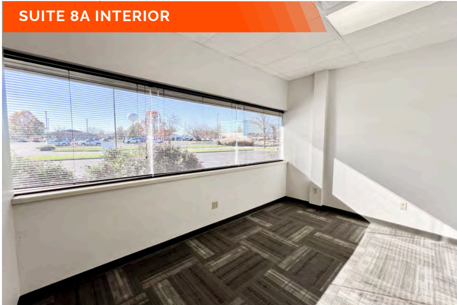
SUITE 8A INTERIOR