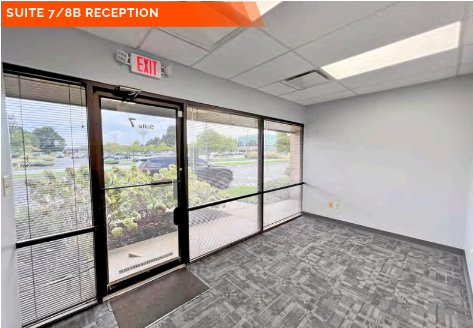
SUITE 7/8B RECEPTION