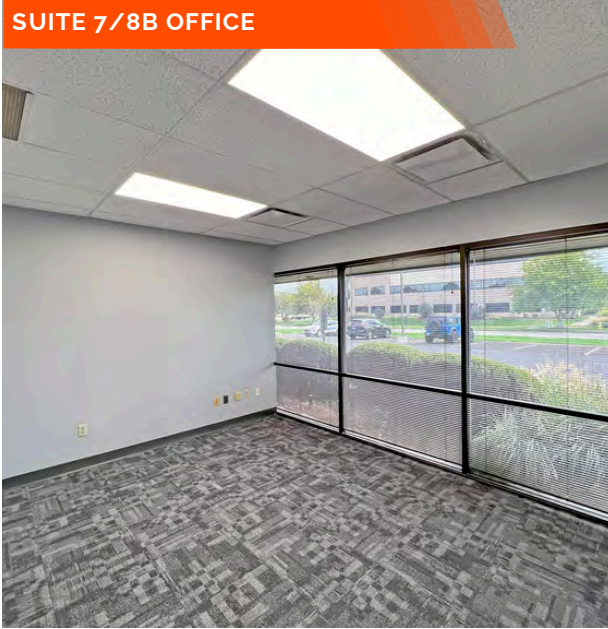
SUITE 7/8B OFFICE