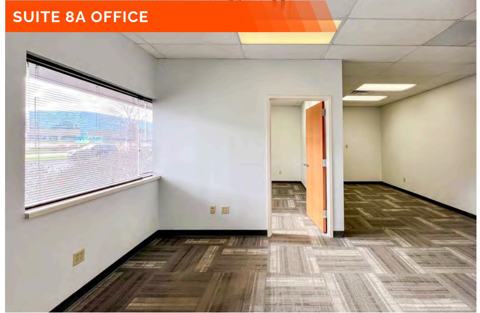
SUITE 8A OFFICE