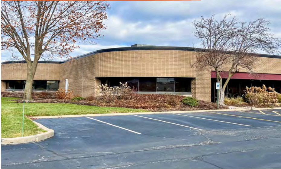
SUITE 12 ENTRANCE