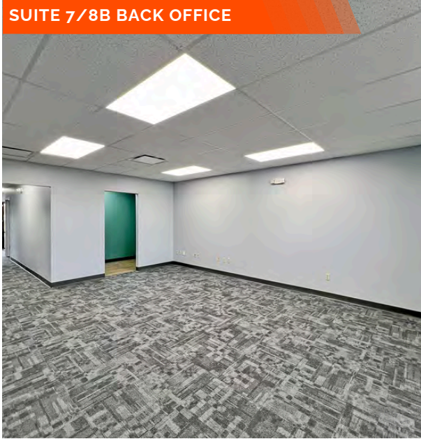
SUITE 7/8B BACK OFFICE