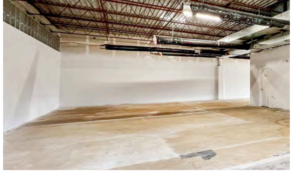
SUITE 12 INTERIOR