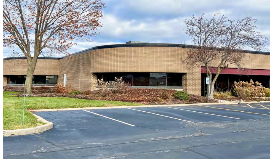
SUITE 12 ENTRANCE