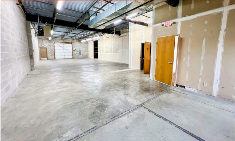
SUITE 16 INTERIOR WAREHOUSE