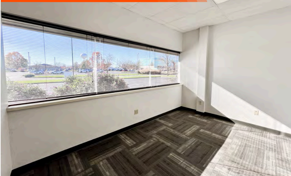
SUITE 8A OFFICE