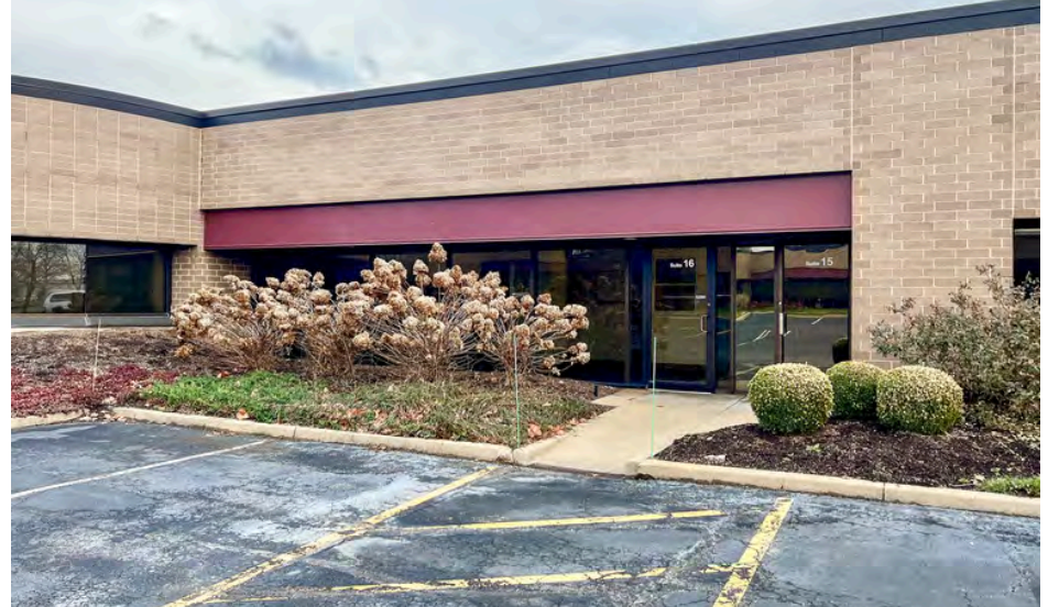
SUITE 16 ENTRANCE