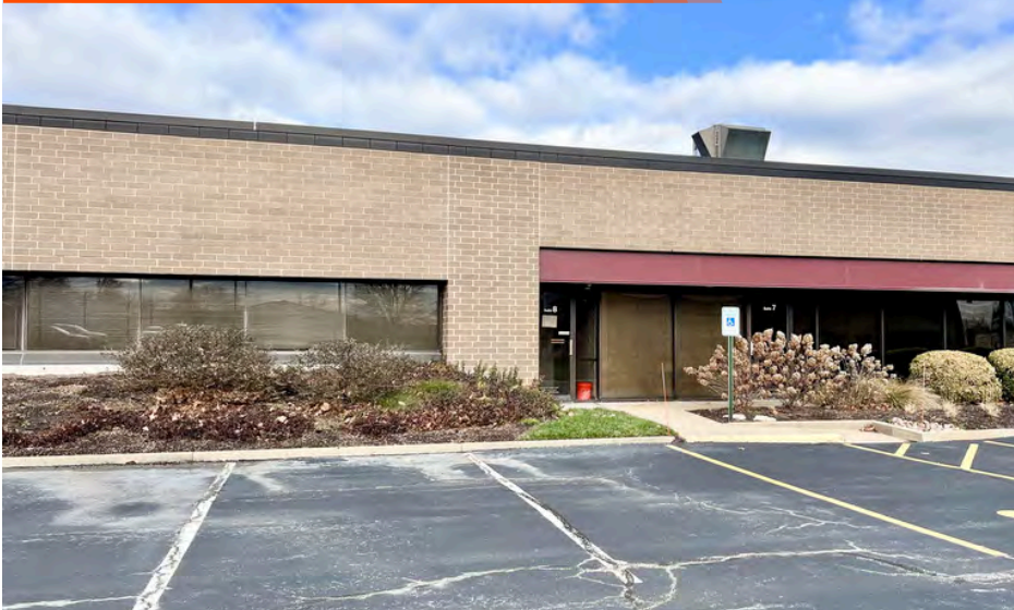
SUITE 8A AND 7/8B ENTRANCE