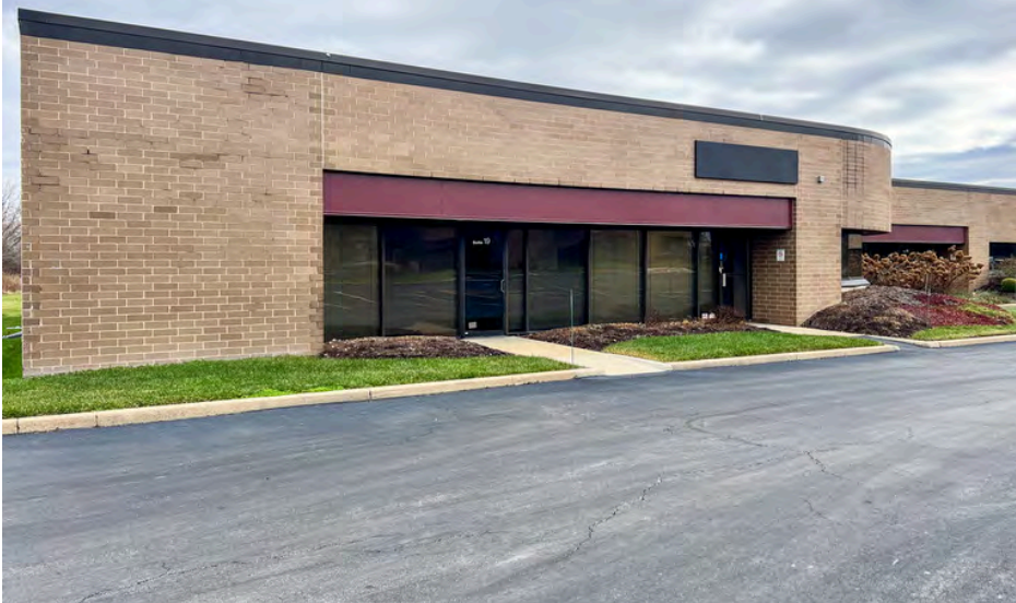
SUITE 19 ENTRANCE