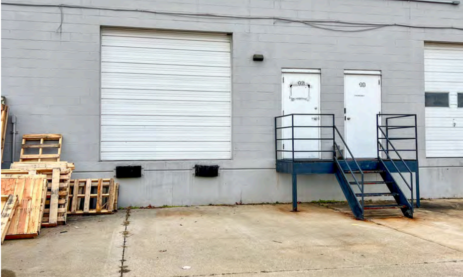
SUITE 16 DOCK DOOR