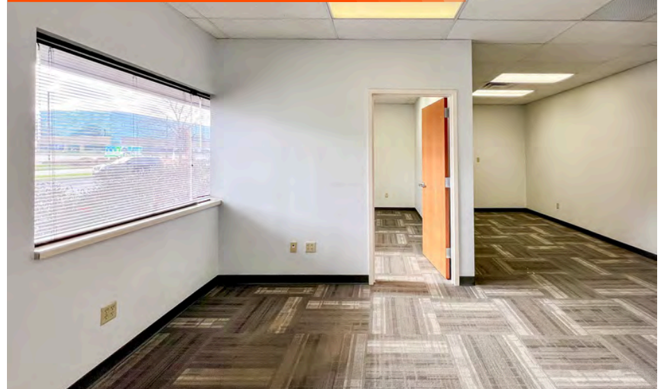
SUITE 8A INTERIOR