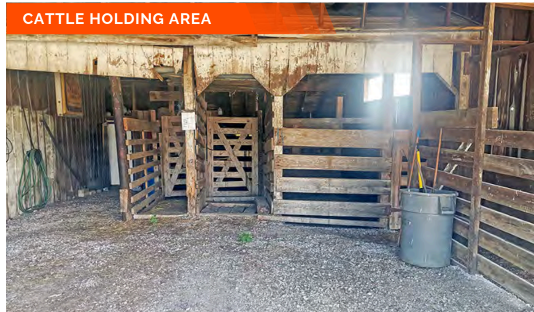
CATTLE HOLDING AREA