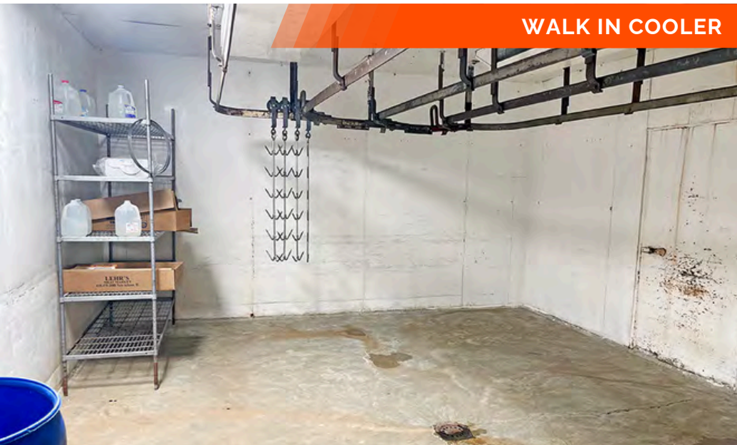
WALK IN COOLER