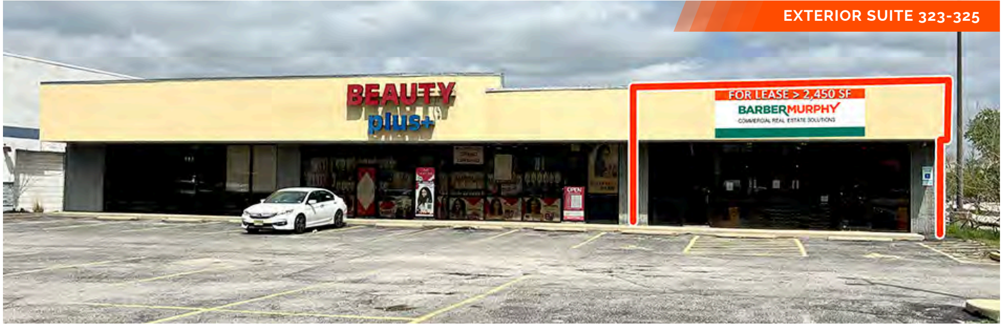
EXTERIOR SUITE 323-325