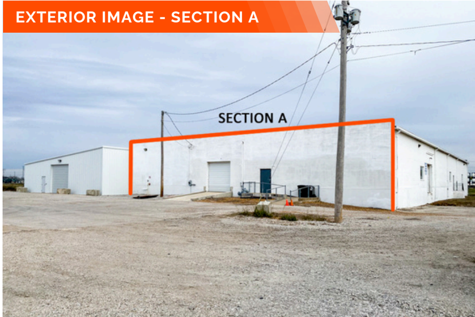
EXTERIOR IMAGE - SECTION A