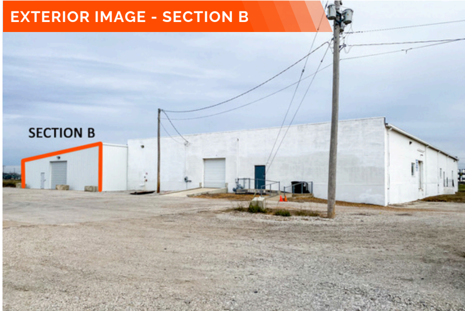
EXTERIOR IMAGE - SECTION B