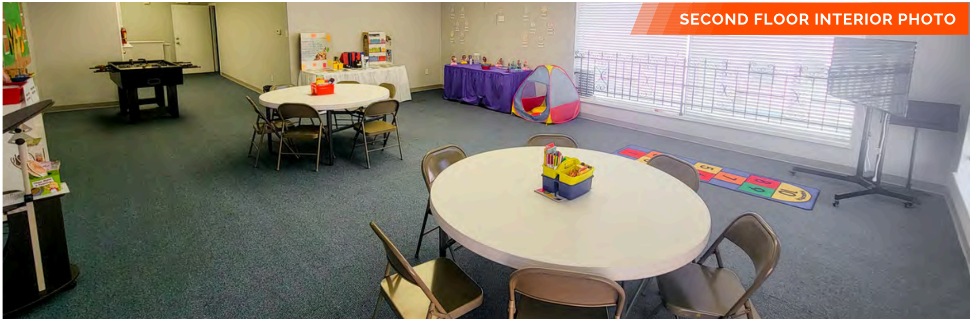
SECOND FLOOR INTERIOR PHOTO

402 & 404 E Main St, Belleville, IL 62220