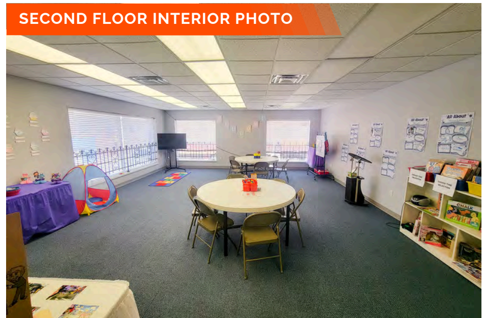
SECOND FLOOR INTERIOR PHOTO