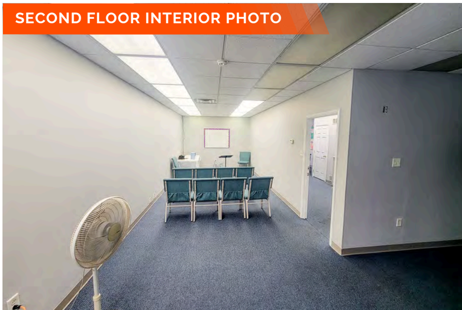
SECOND FLOOR INTERIOR PHOTO