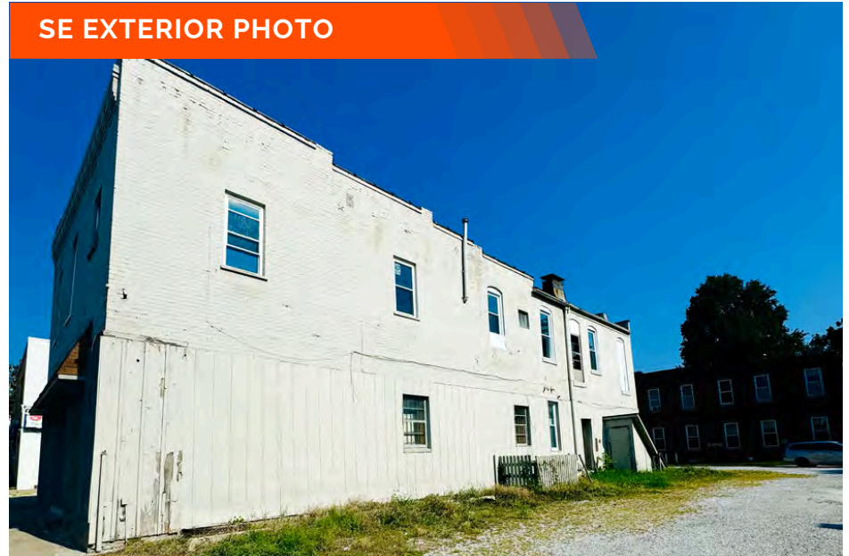
SE EXTERIOR PHOTO