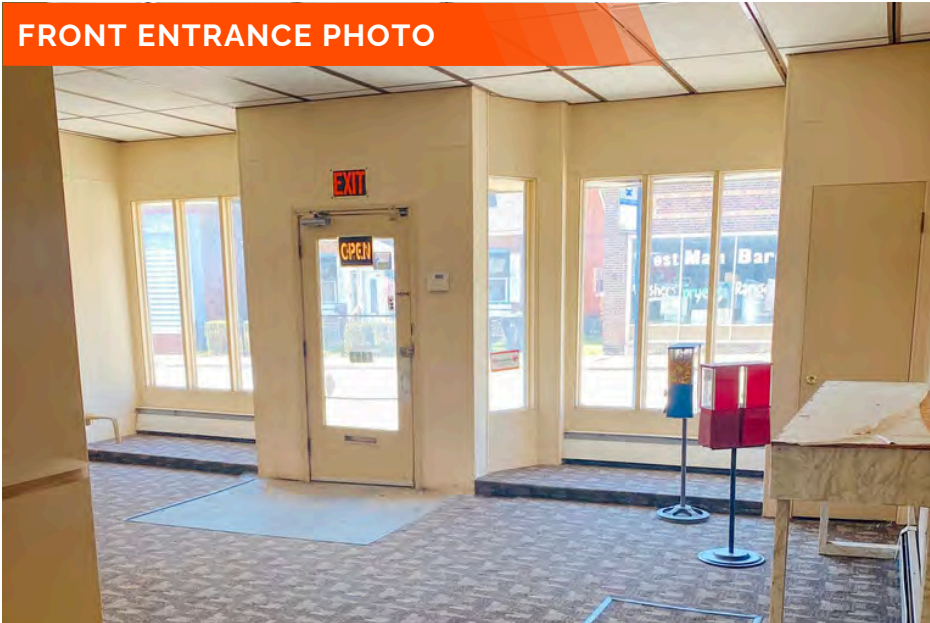
FRONT ENTRANCE PHOTO