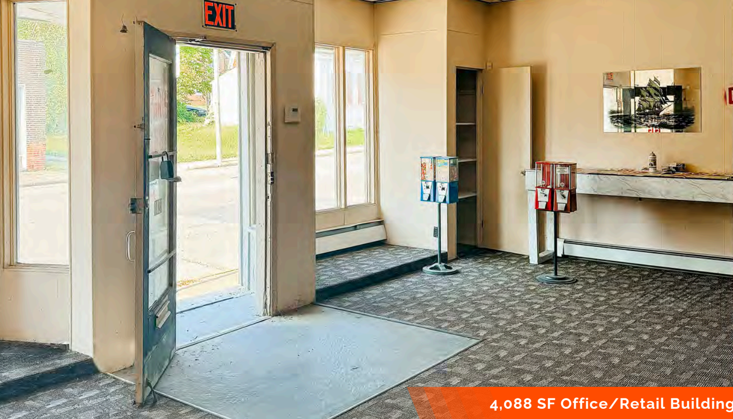
4,088 SF Office/Retail Building

A historic downtown Belleville commercial building with 2 levels totaling 4,088 SF, an attached parking lot, and an overhead door is for sale AS-IS.