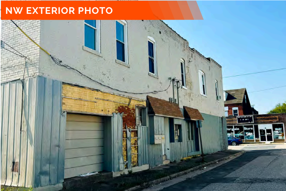
NW EXTERIOR PHOTO