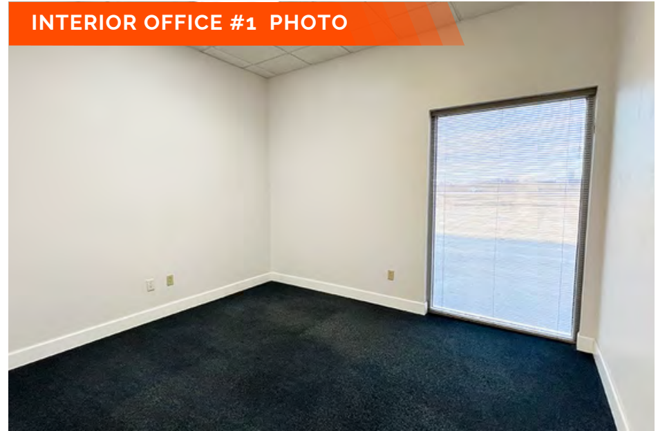
INTERIOR OFFICE #1 PHOTO