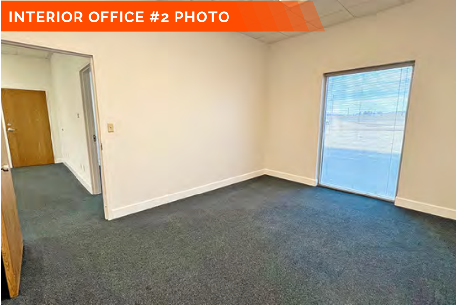
INTERIOR OFFICE #2 PHOTO