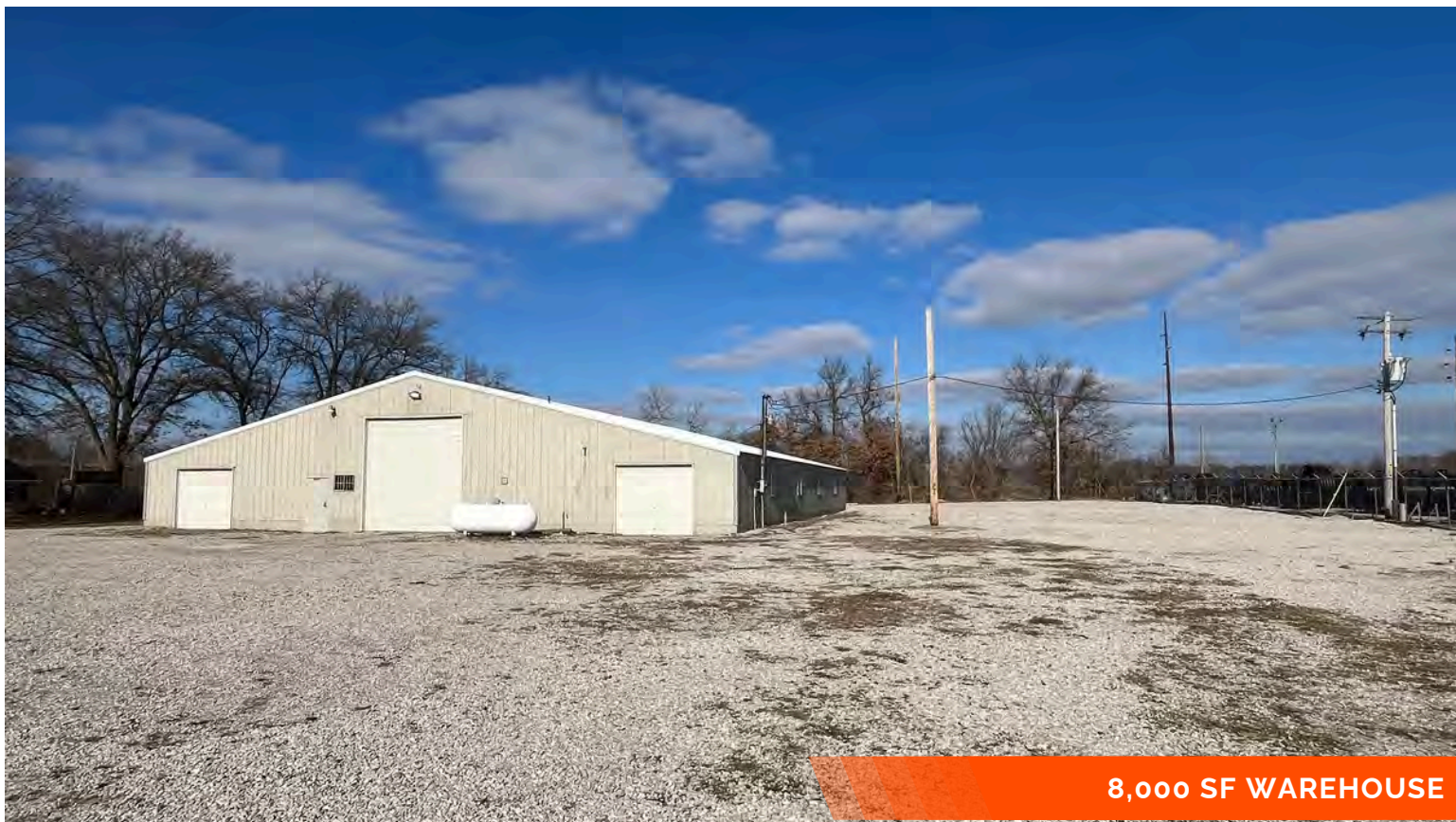
8,000 SF WAREHOUSE