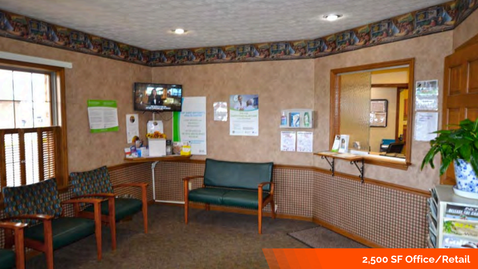
2,500 SF Office/Retail