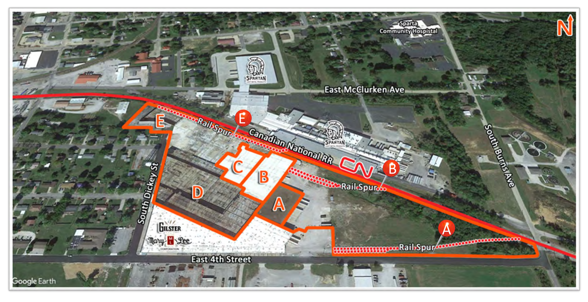
Rail Service to Section E