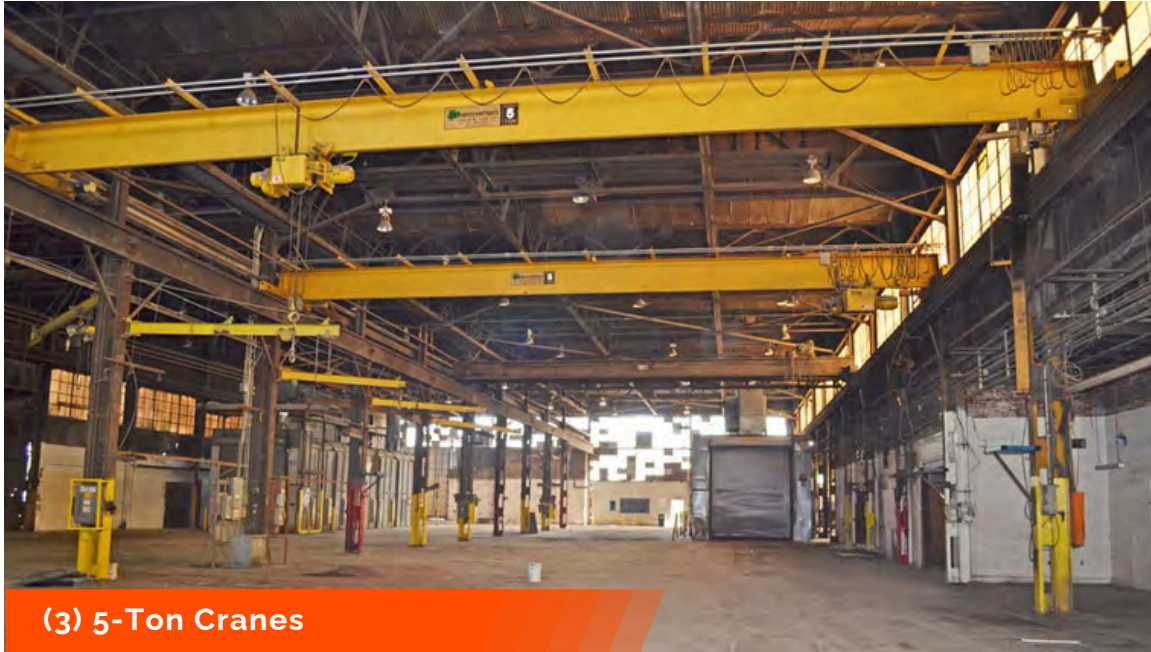
(3) 5-Ton Cranes

2701 Converse Ave., East St. Louis, IL 62207