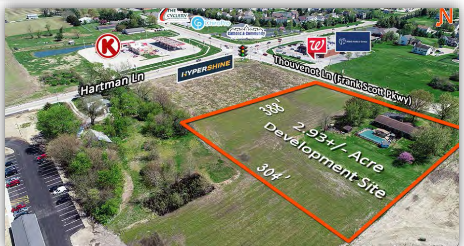
1318 Thouvenot Ln (Frank Scott Pkwy)